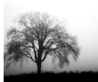
Luke 6:43 "For a good tree brings not forth corrupt fruit; neither does a corrupt tree bring forth good fruit."

Luke 6:43 "For a good tree brings not forth corrupt fruit; neither does a corrupt tree bring forth good fruit." When we accepted Jesus into our lives, we made a covenant— an agreement that cannot be broken— to love according to the Word of God— consistently; regularly; everyday no matter what. No matter what anyone else says or does, no matter what we are asked to do. No matter what our emotions say. What does the