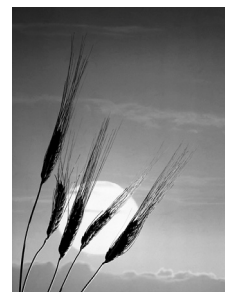
The Lord asks, "Will you work in my fields?"

short! The day is near! Stir yourselves up! Join us in the fields as we gather in an abundant harvest quickly! -Amen