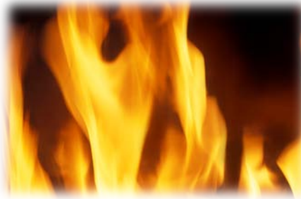
Flame of Fire in the army of God...